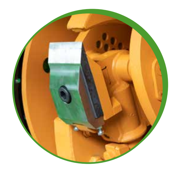
Solid wood and trunks → quantities up to 150 m³/h e.g. for trunk wood