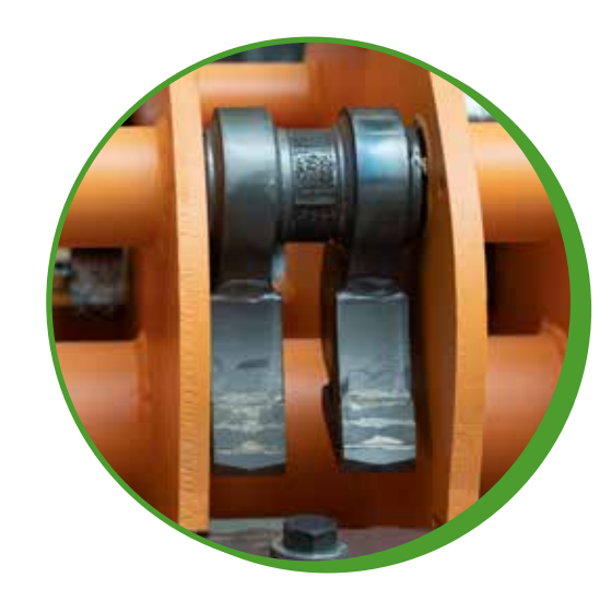
Pallets, old wood, demolition wood, root wood → result up to 230 m³/h e.g. for pallets