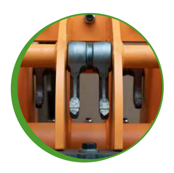
Organic waste → throughput up to 200 m³/h e.g. horse manure