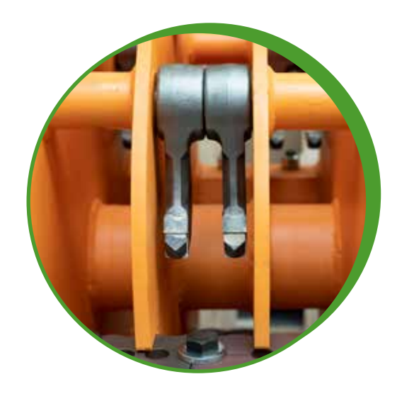
Green waste, corn silage, turnips → output up to 240 m³/h e.g. for green waste

A rotor with 10 fixed shredder tools with chopping qualities ensures excellent results in the processing of biomass. An innovative safety concept against contaminants also convinces.