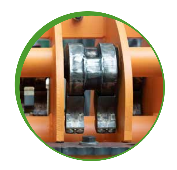
Bark, peat processing → capacity up to 210 m³/h e.g. for bark